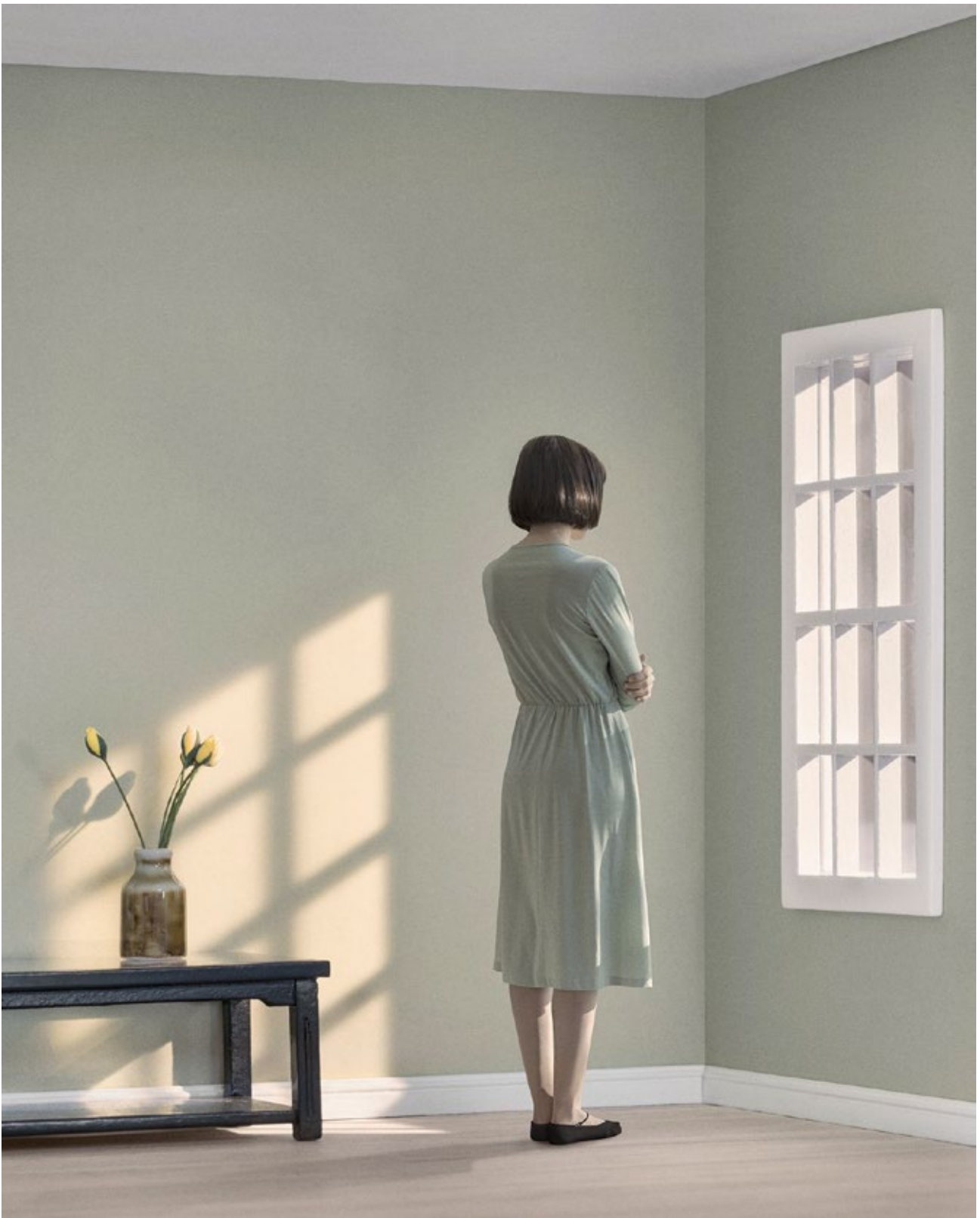
Absence #1, 2019 Archival fine art print - Edition 10 of 10 50 x 40 cm.