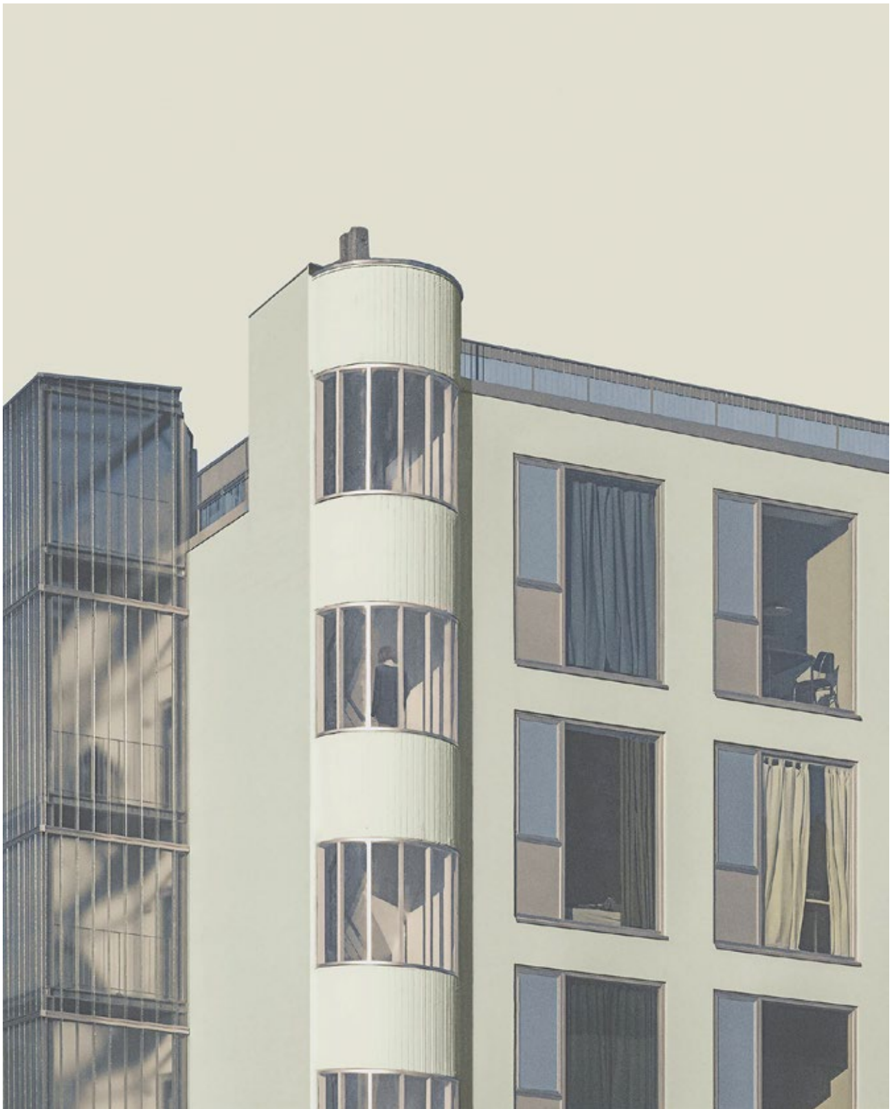
Resort #3, 2026 Archival fine art print - Edition of 6 110 x 90 cm.