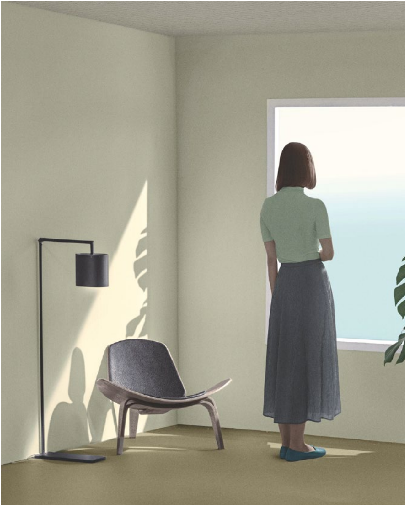
Within Frames #3, 2025 Archival fine art print - Edition of 6 110 x 90 cm.