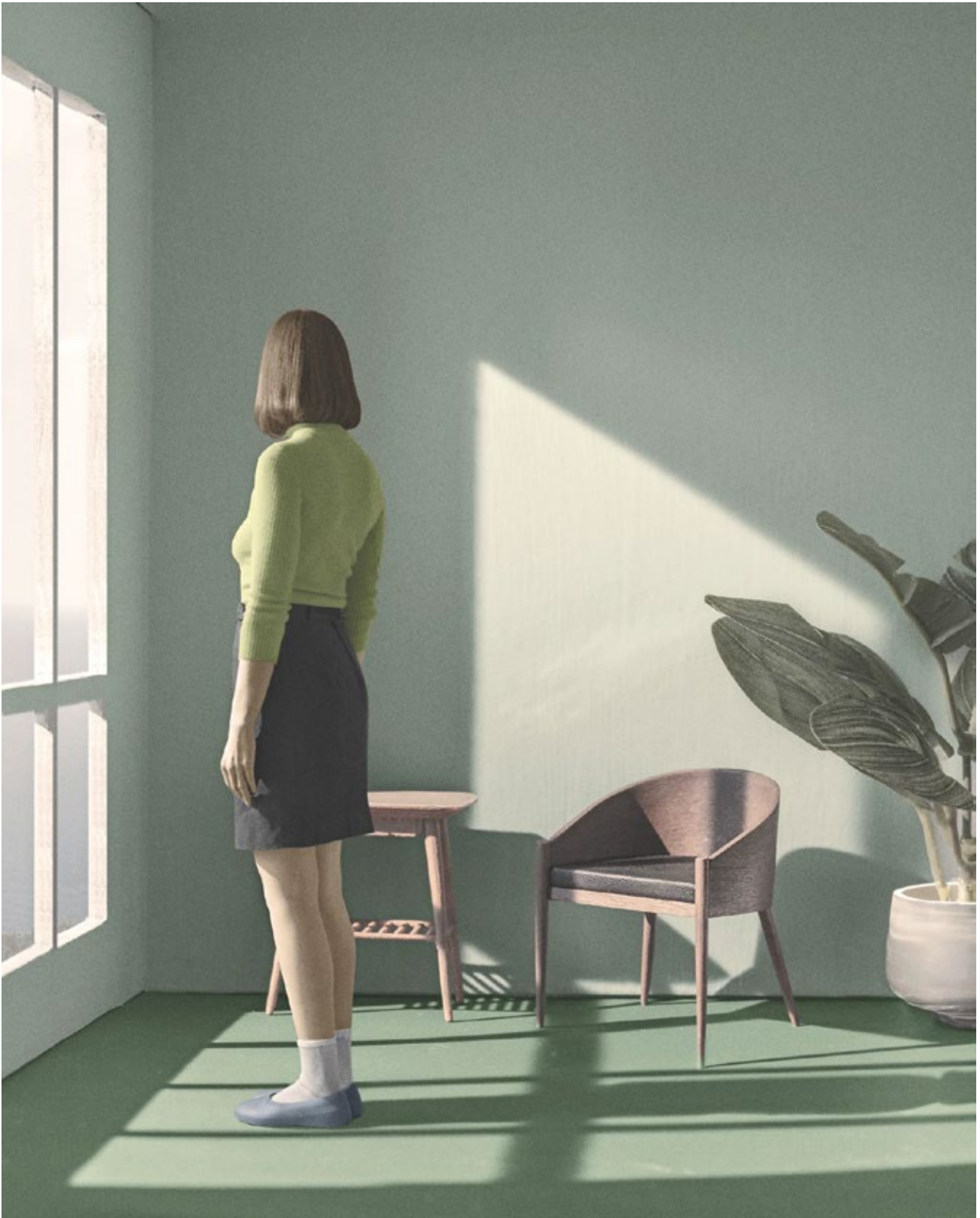
Within Frames #1, 2025 Archival fine art print - Edition of 6 110 x 90 cm.