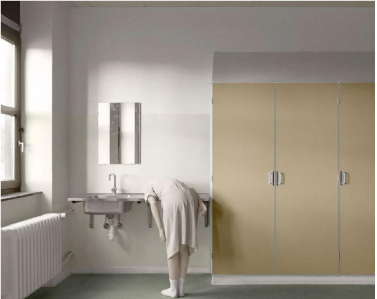
I'm not here #3, 2022 Archival fine art print - Edition of 6 90 x 110 cm.