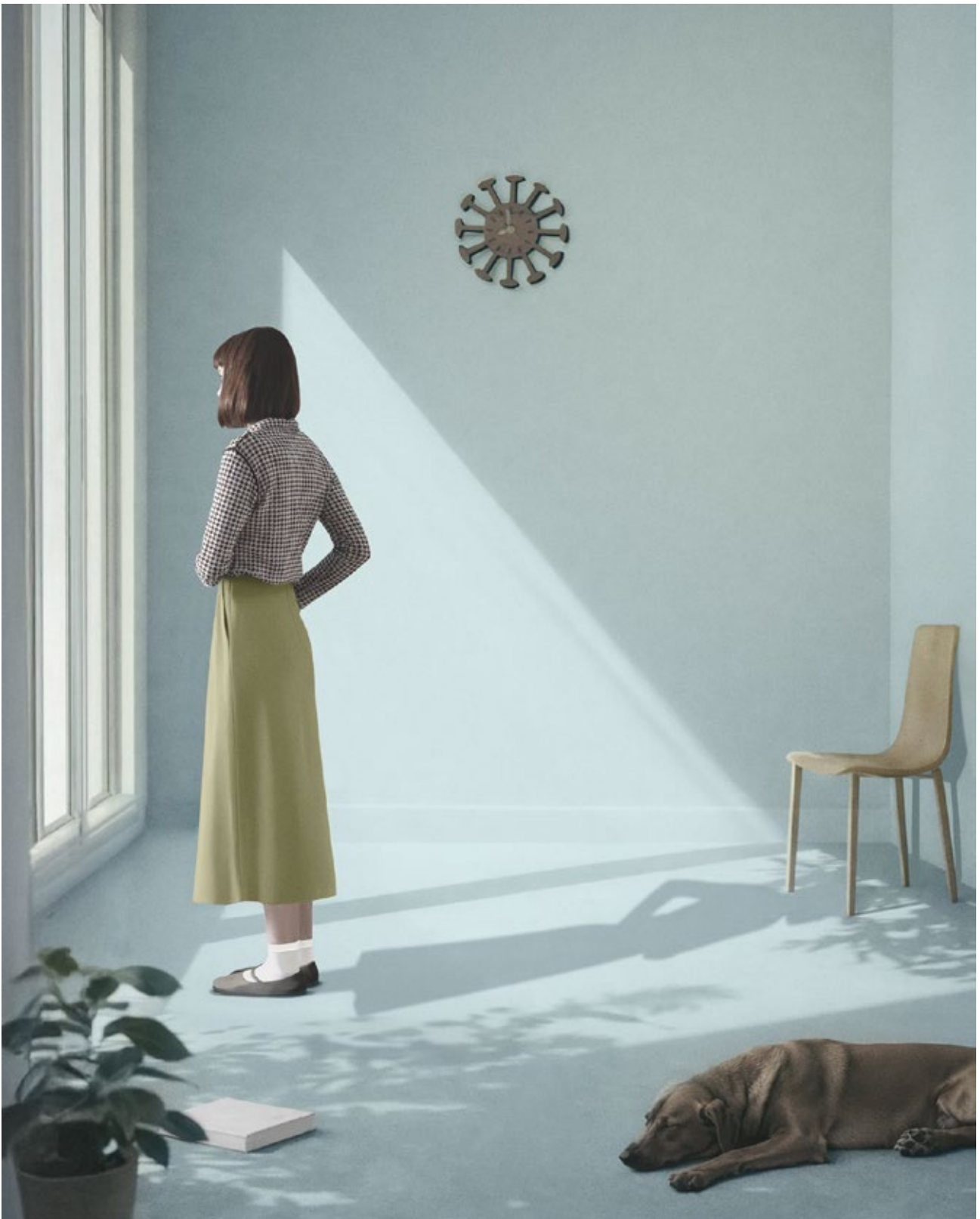
Within Frames #8, 2026 Archival fine art print - Edition of 6 110 x 90 cm .