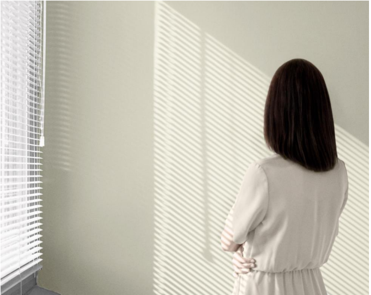
I'm not here #1, 2022 Archival fine art print - Edition of 10 40 x 50 cm.