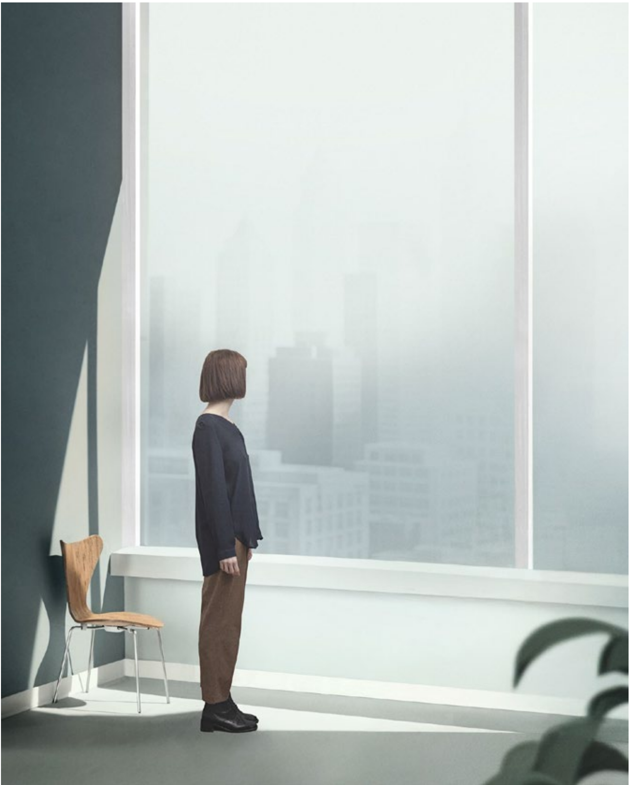
Within Frames #6, 2026 Archival fine art print - Edition of 6 110 x 90 cm.