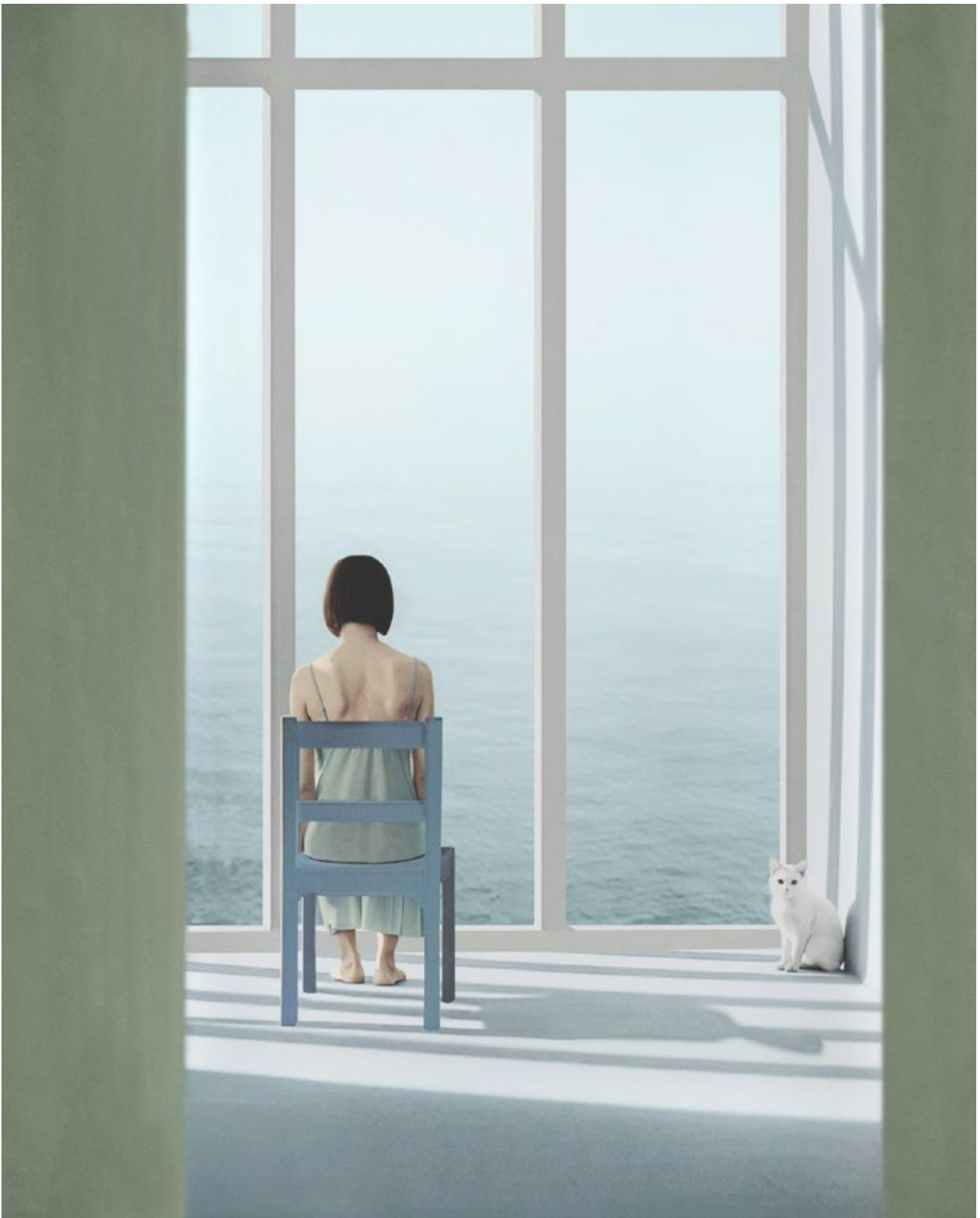
Within Frames #7, 2026 Archival fine art print - Edition of 6 110 x 90 cm.